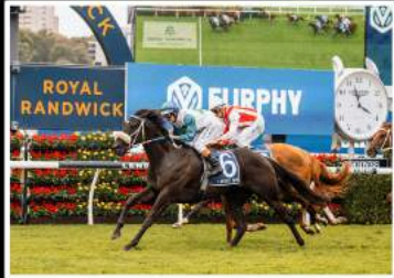
I Wish I Win G1 TJ Smith Stakes

Every generation writes the next chapter.