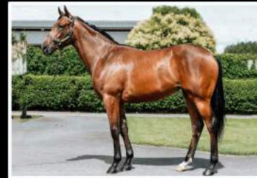
Super Seth x Valpolicella filly $625k yearling