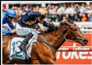
Tofane Four-time Group 1 winner