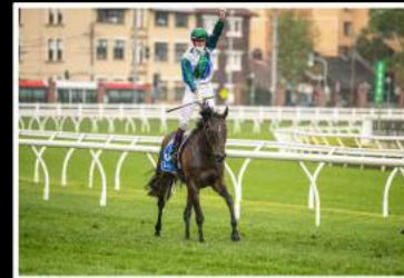
Never Been Kissed G1 Flight Stakes