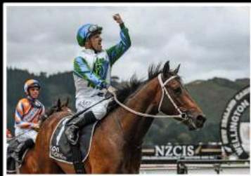
Codigo L.R Irt Wellesley Stakes