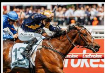
Tofane Four-time Group 1 winner