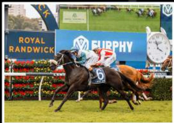
I Wish I Win G1 TJ Smith Stakes

Every generation writes the next chapter.