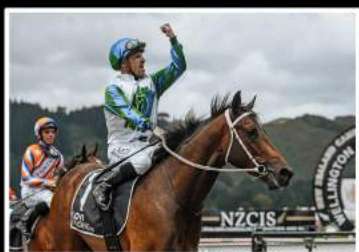
Codigo L.R Irt Wellesley Stakes