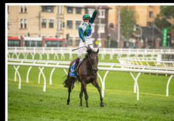
Never Been Kissed G1 Flight Stakes